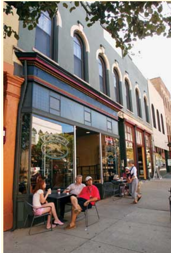
Figure 1 - Sidewalk café located near building to allow safe pedestrian access.

Encroachments may be allowed where it can be determined by the City that the encroachment would not result, individually