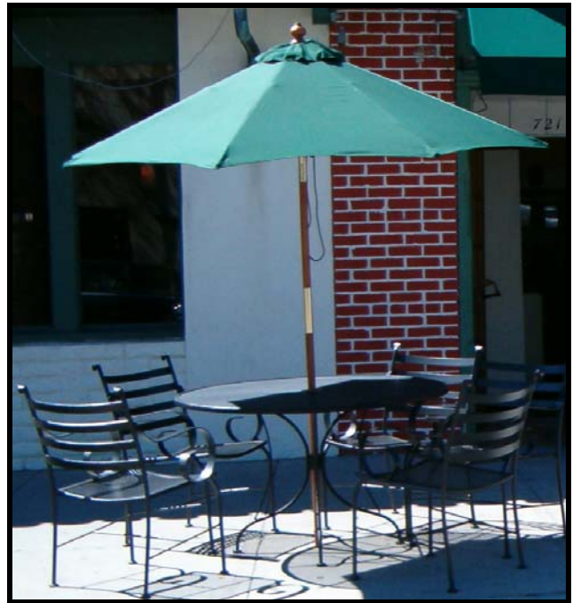
Figure 3 - Table, chairs and umbrella constructed of durable painted metal.