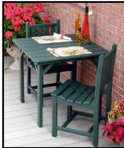
Figure 4 - Table, and chairs constructed of durable painted material

vices are prohibited. Permanently mounted heating devices shall be reviewed by the Public Works Director for safety and aesthetics and require